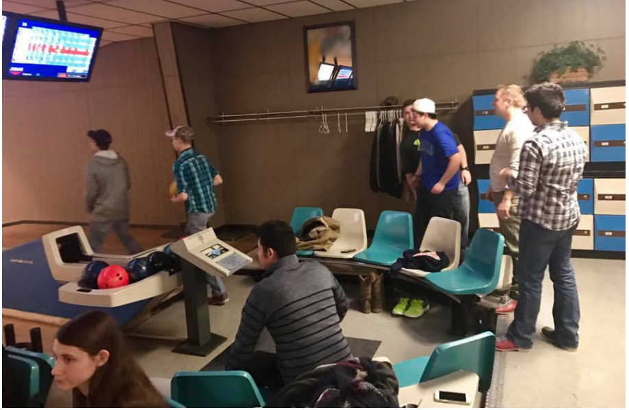
Yesterday evening (March 11, 2017) there was a great turnout for the CAC FISH Student Ministry bowling night. Everyone had a fun time.