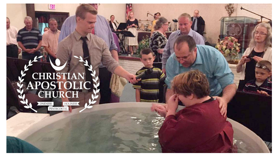
Join us in celebrating the resurrection of Jesus Christ on Easter Sunday!