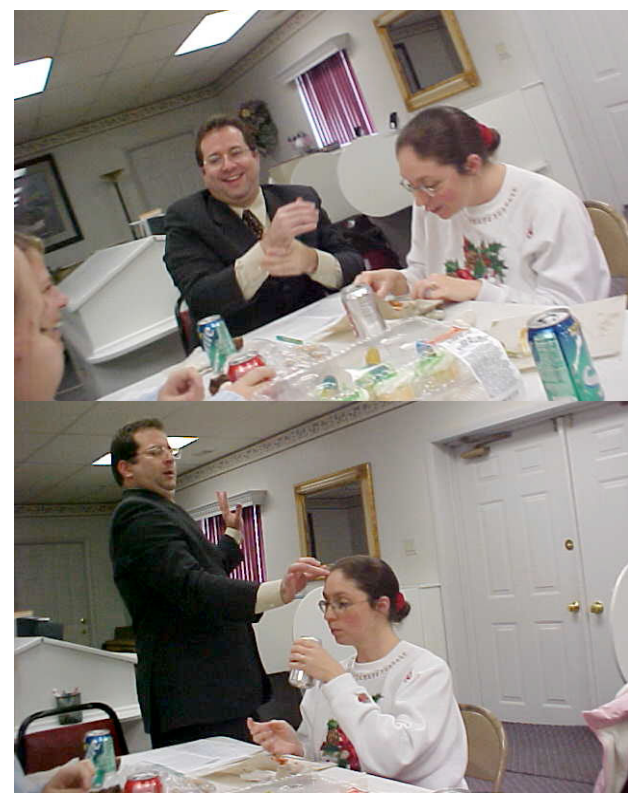
Blast from the past — Above: 11 years ago. Below: 7 years ago.