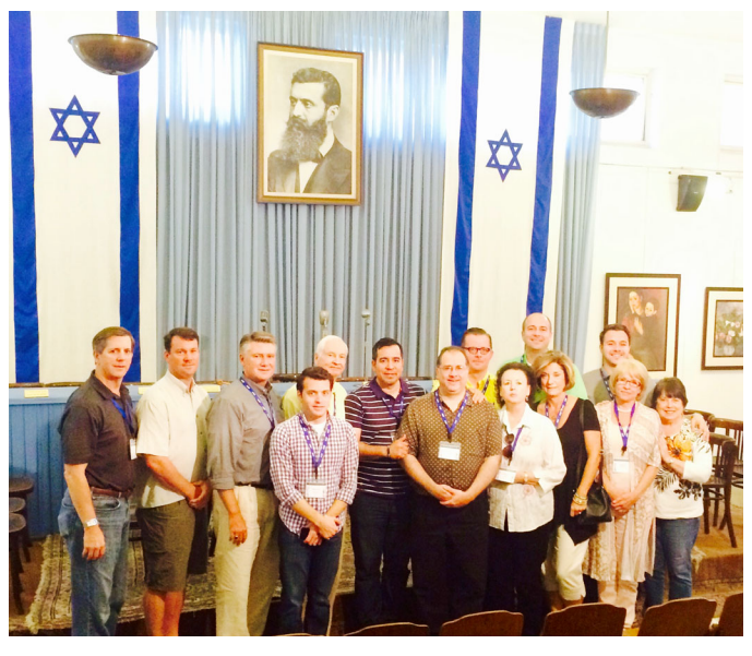
With the entire AIEF group in Israel's Independence Hall in Tel Aviv.