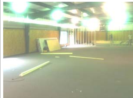
New Daughter Work Opening in Oak Hill