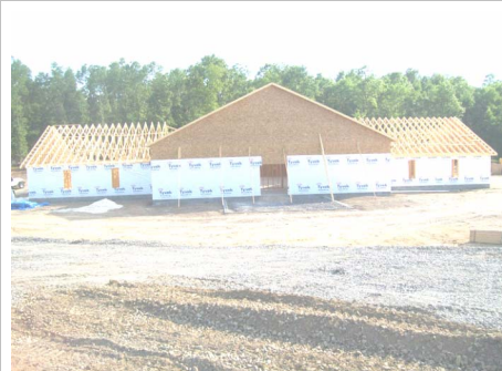
New Church Building Almost Under Roof