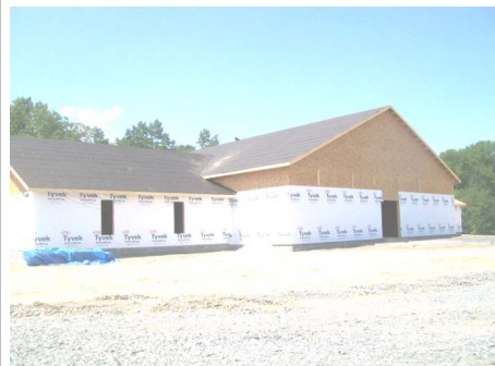
Almost Under Roof; So Exciting!