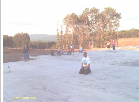
Prayer Walk on the Foundation