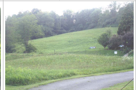
The highest meadow, which borders on I-79, is about 2.4 acres.