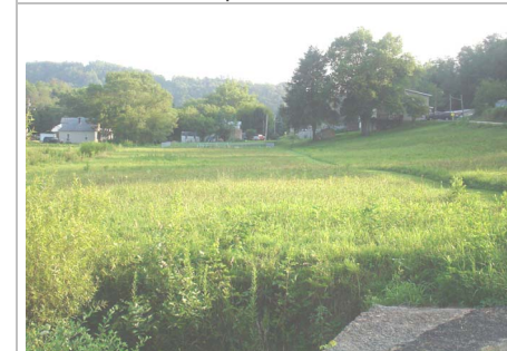
This meadow is about 2 acres. It is one of four that total 7.2 acres.