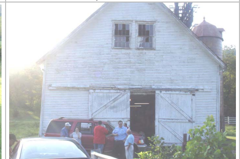
100-year-old barn on the property. Note the billboard (background) that serves I-79 traffic.

This meadow land is located adjacent to I-79, only a couple tenths of a mile from Exit 110. Our church has long sought to get a better location. After years of looking and praying, we had resolved to just have faith and patiently wait for God to help. God has answered in a big way! We will plan to move, Lord willing, to this new location!