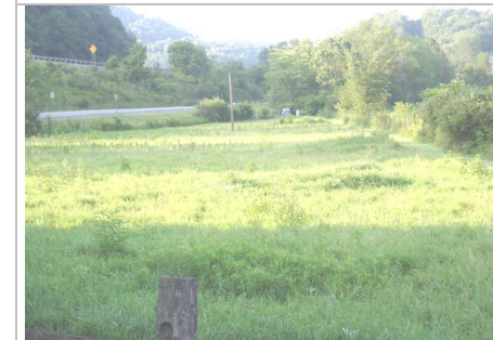
You can see I-79's guardrail overlooking the property. This meadow is about 1.4 acres.