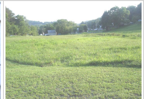
Part of the 7.2 acres: This meadow, one of four, is about 1.5 acres.